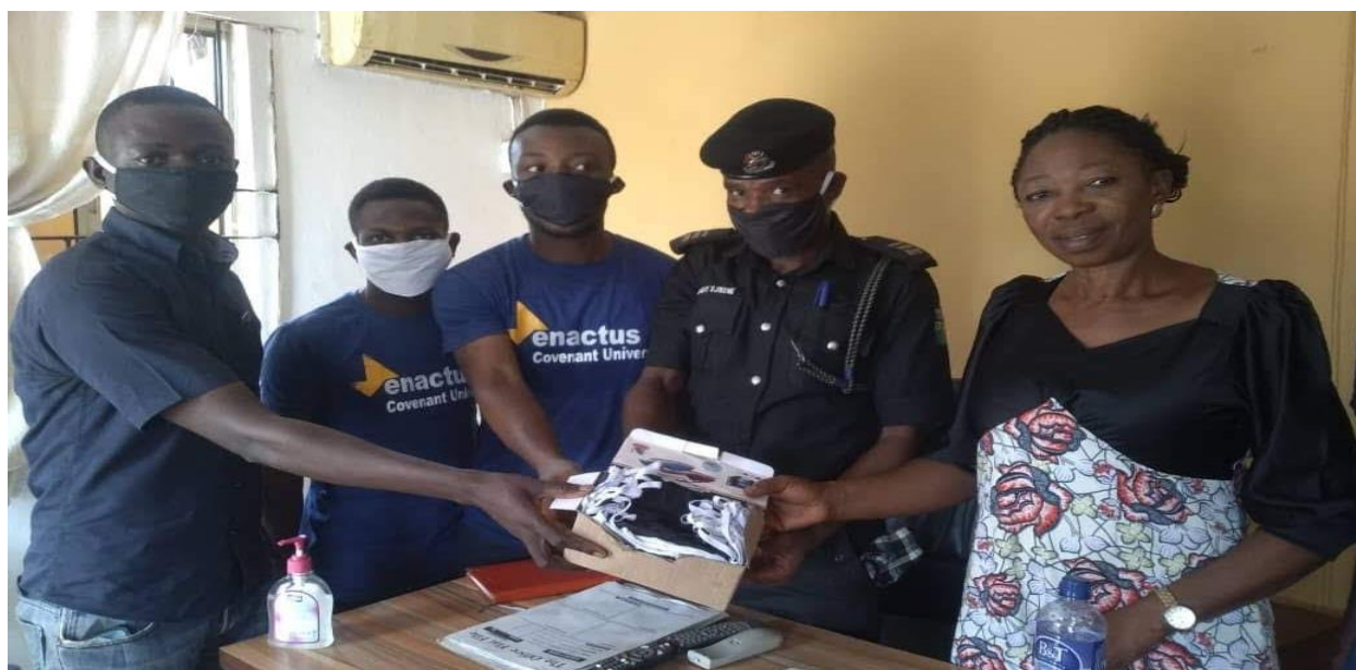
PHOTO 6b: RCE Ogun Provision of Sanitisers & Face Masks at Police Station with Enactus