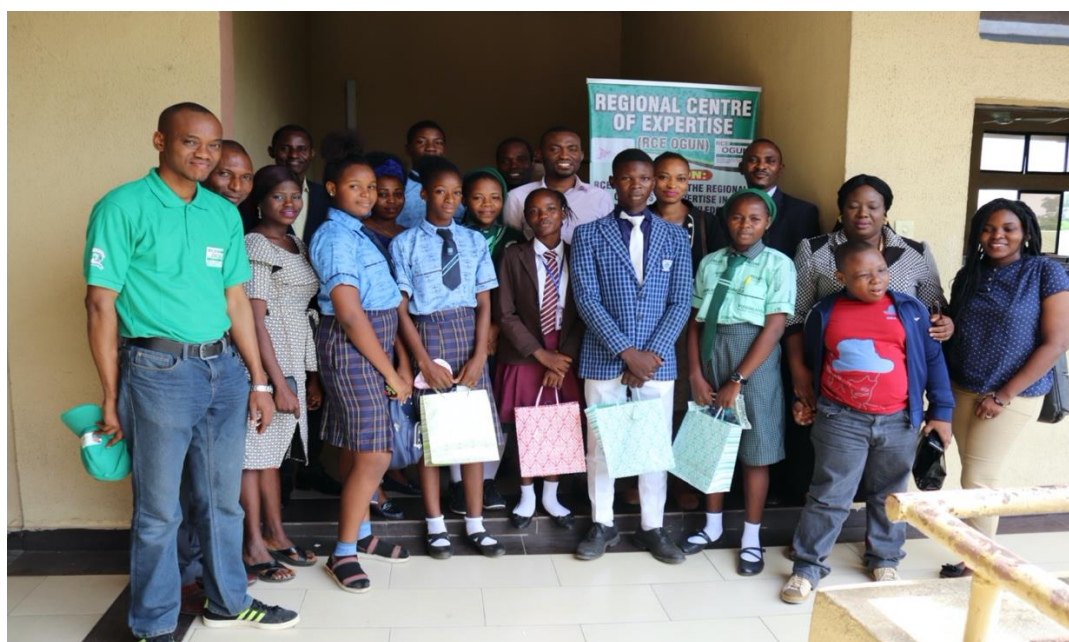
PHOTO 4: Cross-Section of Members of RCE Ogun with the Participating Students & Accompanying Teacher