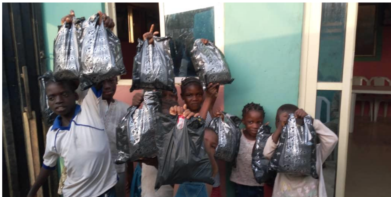
PHOTO 6a: RCE Ogun Food Palliative Distribution for School Children with Enactus