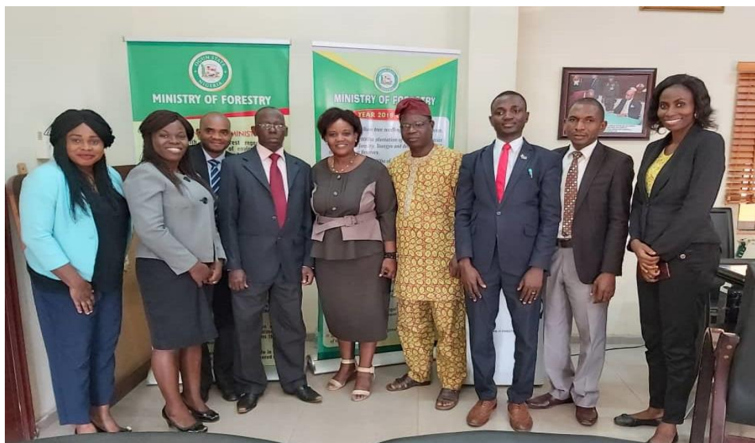
PHOTO 1a: Cross-Section of Members of RCE Ogun and Ogun State Government Officials

and issues of partnership were discussed. The government pledged support and commitment to the current and future activities of the Centre. Specifically, a memorandum of understanding (MOU) is being planned between RCE Ogun and the Ogun State Ministry of Forestry with a focus on scaling up environmental sustainability in the State. Another area for collaboration is the creation of botanical and zoological garden with a view to conserving plants and animals considered to be endangered species. This was made when a team of the ministry paid a fact-finding visit to RCE Ogun Team at Covenant University.