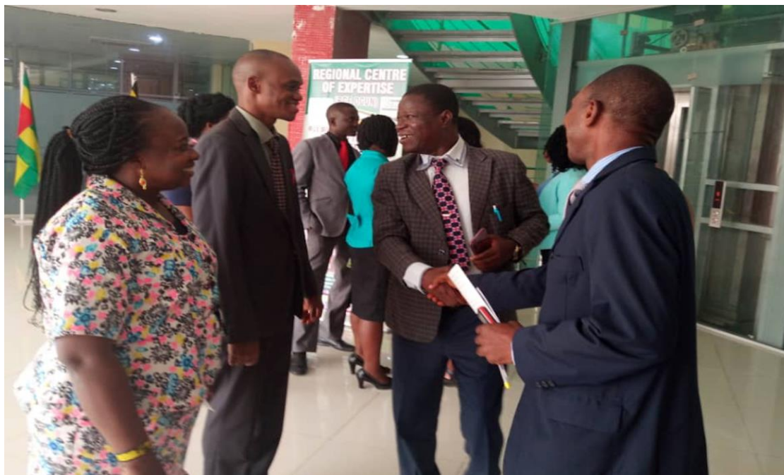
PHOTO 1b: RCE Ogun Members with Officials from Ogun State Ministry of Forestry