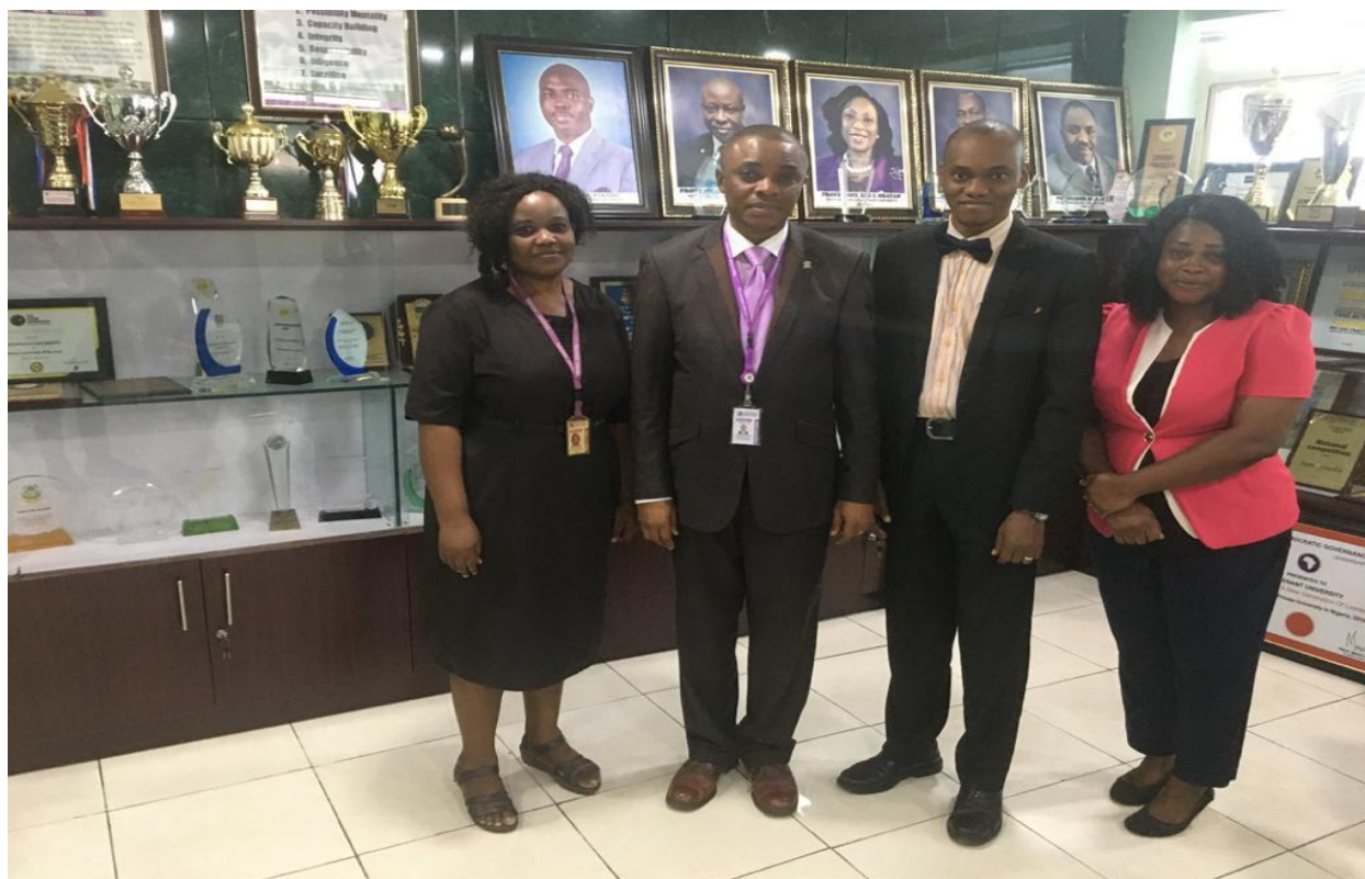
PHOTO 3: Cross-Section of Members of RCE Ogun & the Acting VC of Covenant University