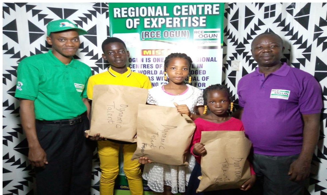
PHOTO 5: Some members of RCE Ogun & kids at the Hebron FM Dynamic Talent Programme

RCE Ogun partnered with Hebron FM 95.9 on its Dynamic Talent program for young minds. The programme teaches children the various aspects of the sustainable development goals and how they can contribute to the sustainability agenda at their level.